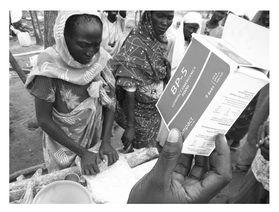
Distribution of BP-5 in Yusuf Batil Refugee Camp, Upper Nile State, South Sudan, July 2012

are the mechanisms for delivering those nutrients. Yet there will, of course, be a cadre of experts further up the aid architecture that no doubt shape the broad architecture of aid policy using legal and diplomatic categories.