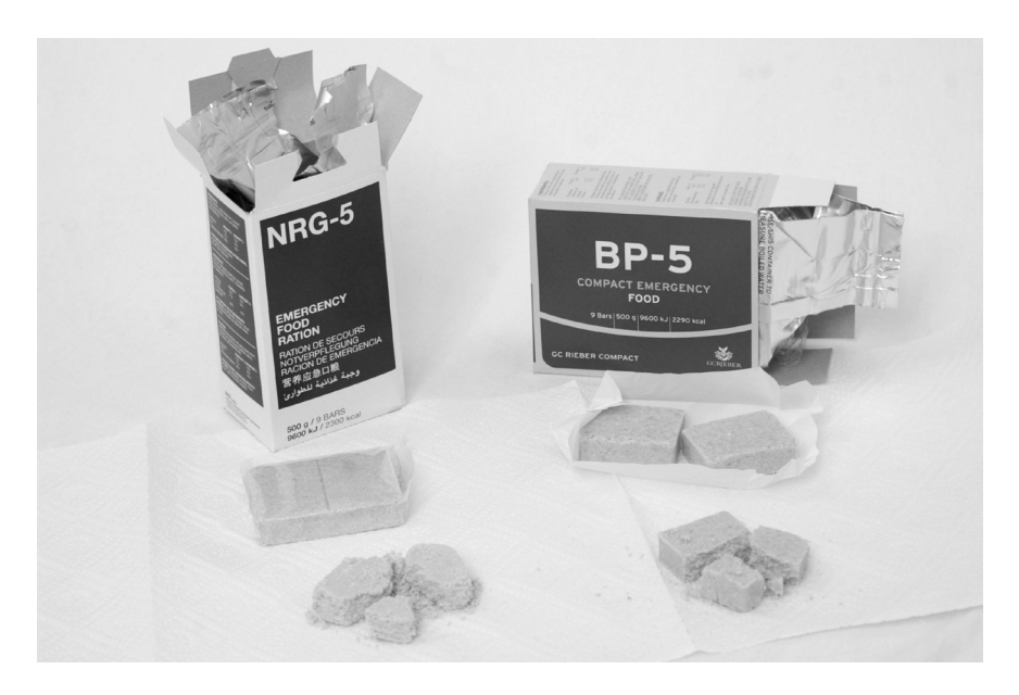
Two >compact emergency food< products, NRG-5 (by a German enterprise) and BP-5 (by a Norwegian enterprise), 2014

\label{lem:commons} \begin{tabular}{ll} $$(Wikimedia Commons, Johannes Pribyl (Jokep), <a href="https://commons.wikimedia.org/wiki/File:Detailed_Comparison_NRG-5_BP-5_(Pribyl).jpg">https://commons.wikimedia.org/wiki/File:Detailed_Comparison_NRG-5_BP-5_(Pribyl).jpg>, <a href="https://creativecommons.org/licenses/by-sa/3.o/legalcode">https://creativecommons.org/licenses/by-sa/3.o/legalcode</a>)