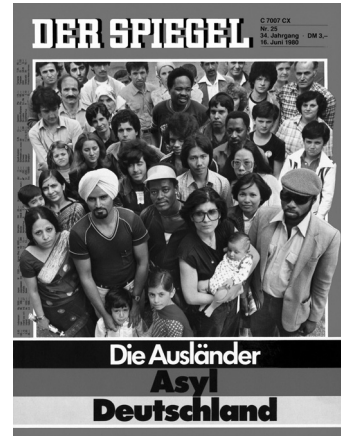
Cover of SPIEGEL magazine, 25/1980.

The social-liberal federal government implemented a dual strategy in terms of migration policy, promoting the long-term integration of the foreigners while also adopting repatriation assistance measures and tighter restrictions on new immigration. The minutes of the cabinet meeting on 11 November 1981 contain the following passage: ›The Federal Chancellor [Schmidt] stresses in the discussion that the Federal Republic of Germany is not a country of immigration and nor does it want to become one. He went on to say that the proportion of foreigners in some neighbourhoods in big cities was already 20 % to 30 %. This was, however, no longer sustainable, not least in the interests of integration.‹ 102 Both the Asian first host countries and the subsequent host countries like West Germany now drafted more restrictive regulations. The result was a decrease in refugee numbers in 1981/82,