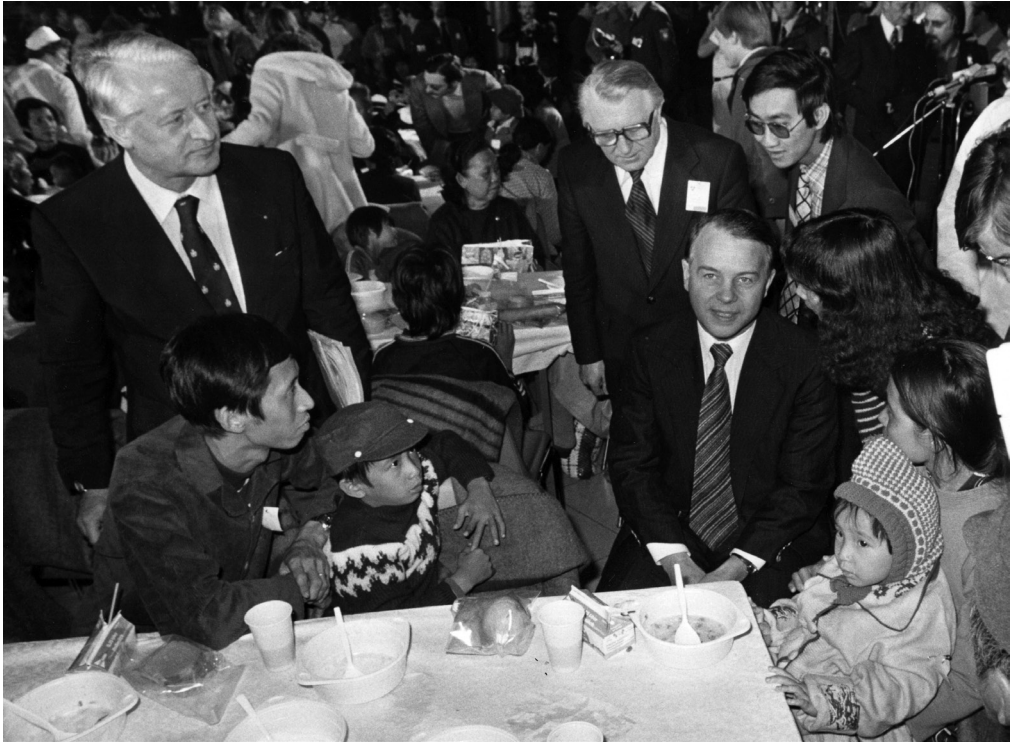
Christian Democrat engagement: Minister-President Ernst Albrecht (right) and Minister of the Interior Wilfried Hasselmann (left) greeting Vietnamese refugees in Lower Saxony, 3 December 1978

refugees were coming so fast while the 500 quota refugees from the military dictatorship in Argentina were still waiting. 30 The question of which refugees were to be preferred clearly had ideological connotations.