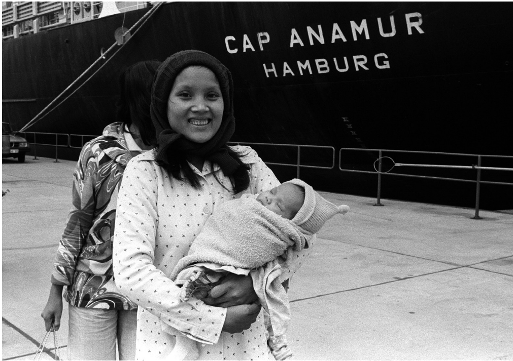
On the return of the Cap Anamur to the port of Hamburg, 27 July 1982

Europe. 111 Only Lower Saxony under Ernst Albrecht continued to demonstrate a willingness to receive more refugees, but it met with opposition from the Federal Ministry of the Interior. 112 The media, meanwhile, had long since turned their attention to other issues. When a new ship named Cap Anamur II put to sea in 1986 and rescued 888 refugees from the South China Sea in a collaborative effort between Germany and France (see this issue's cover photo), journalists showed little interest. Once again it was the states of Lower Saxony, Baden-Württemberg and North Rhine-Westphalia that offered a few hundred places. Saarland, which was governed by Oskar Lafontaine (SPD), offered just six places, and Bavaria not a single one. 113 Federalism both facilitated and blocked the reception of the refugees in equal measure.