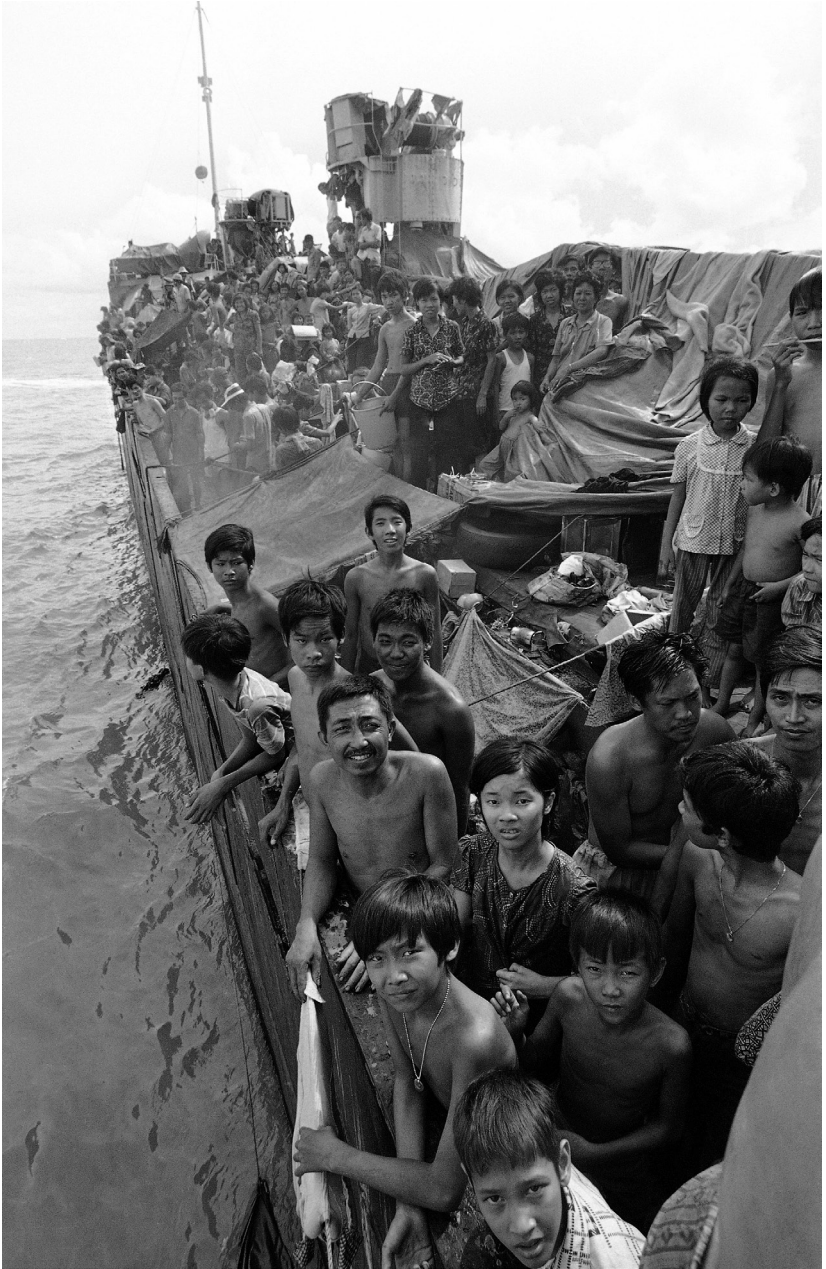
Vietnamese refugees on the deck of the freighter Hai Hong , 22 November 1978. In the database of the photo agency picture alliance, this photo carries the title >Vietnamese Syrians.<