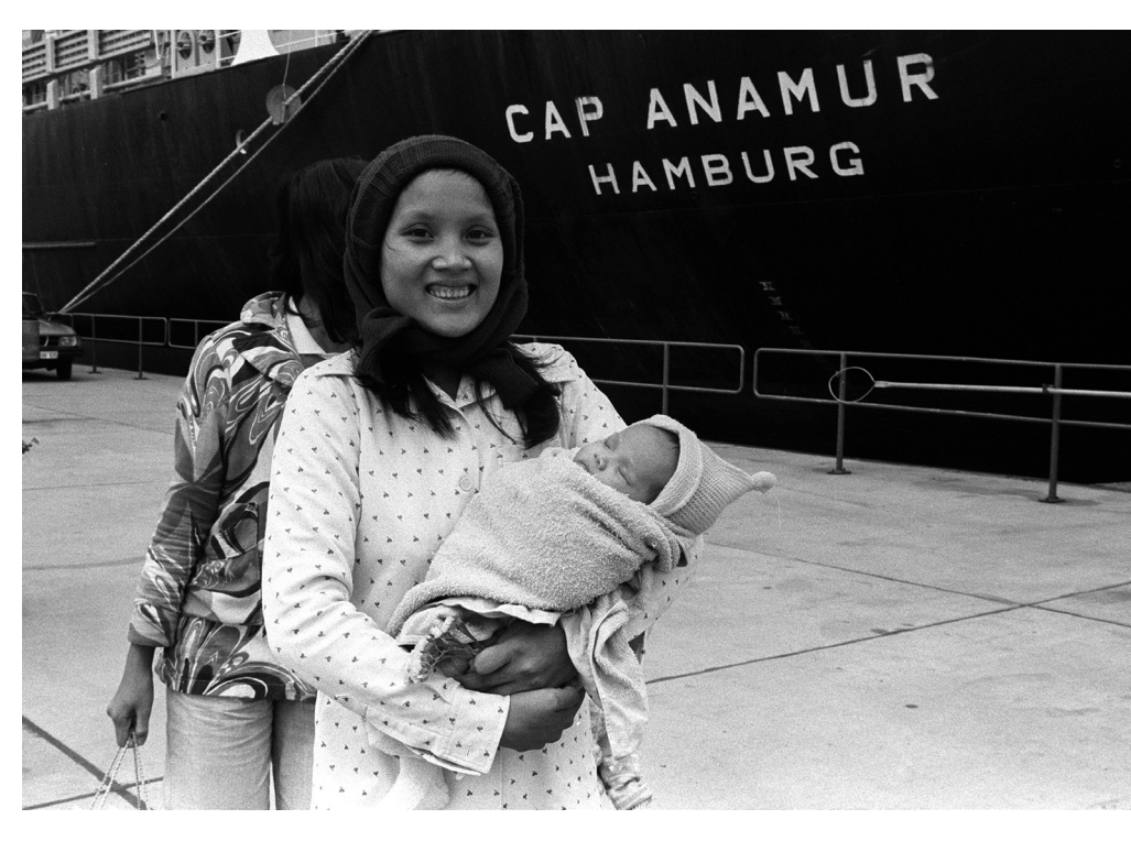
On the return of the Cap Anamur to the port of Hamburg, 27 July 1982

Europe.<sup>III</sup> Only Lower Saxony under Ernst Albrecht continued to demonstrate a willingness to receive more refugees, but it met with opposition from the Federal Ministry of the Interior.<sup>II2</sup> The media, meanwhile, had long since turned their attention to other issues. When a new ship named Cap Anamur II put to sea in 1986 and rescued 888 refugees from the South China Sea in a collaborative effort between Germany and France (see this issue's cover photo), journalists showed little interest. Once again it was the states of Lower Saxony, Baden-Württemberg and North Rhine-Westphalia that offered a few hundred places. Saarland, which was governed by Oskar Lafontaine (SPD), offered just six places, and Bavaria not a single one.<sup>II3</sup> Federalism both facilitated and blocked the reception of the refugees in equal measure.