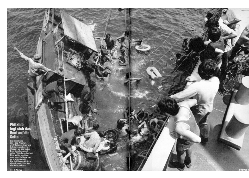
Journalists accompanied the rescue operations and campaigned with dramatic pictures and reports for the Cap Anamur missions.

(from: stern, 16 October 1980, pp. 20-29, here pp. 22-23; photo: Klaus Meyer-Andersen)