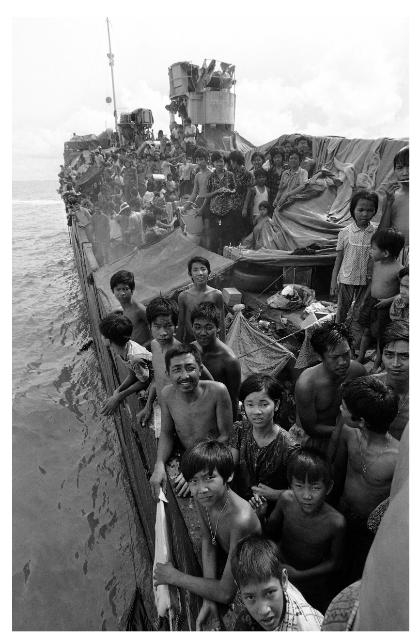
Vietnamese refugees on the deck of the freighter Hai Hong , 22 November 1978. In the database of the photo agency picture alliance, this photo carries the title »Vietnamese Syrians«.