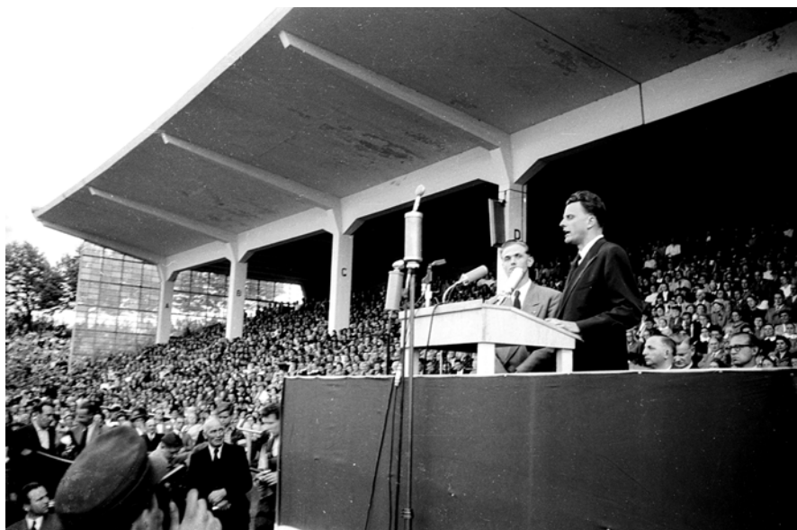
Billy Graham in Düsseldorf, June 1954

In June 1954, American evangelist Billy Graham came to the Federal Republic of Germany for his first revival meetings. In Frankfurt, he preached at the American Christ Chapel, in Düsseldorf at the Rheinstadium, and two days later he closed his first German campaign with a service at the Olympic Stadium in Berlin. Thousands came to see him and hundreds stepped forward at the end of the service to publicly accept Christ as their Savior. Another campaign followed in 1955. The American preacher then returned to Germany again during the 1960s, and his work there peaked in 1970 with his EURO 70 campaign. 1