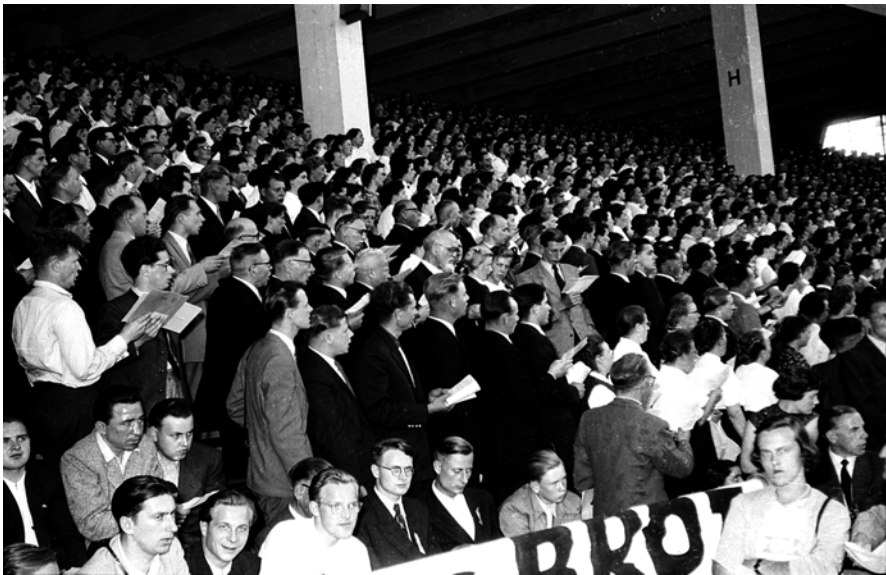
Billy Graham's Audience in Düsseldorf, June 1954