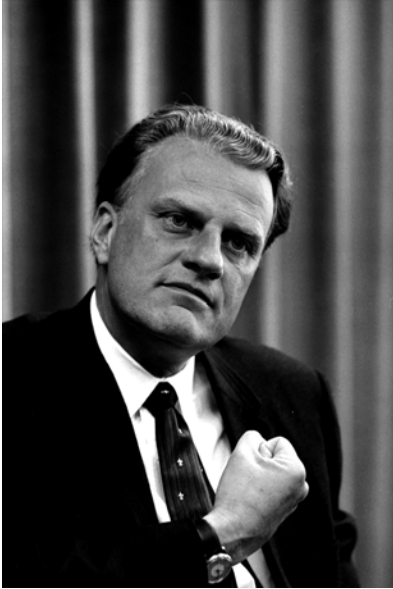
A characteristic portrait of Billy Graham, April 1966

sionary to Germany, but as an ambassador of the Free World. His crusades were as much orchestrations of the imagined community of the West as they were revival meetings. While church officials, theologians, and politicians discussed the importance and meaning of Christian faith in the Free World, it was during Graham's campaigns that ordinary Germans came to know and experience the political meaning of Christian faith in the Cold War order. Their religious and political needs were fulfilled at the same time.