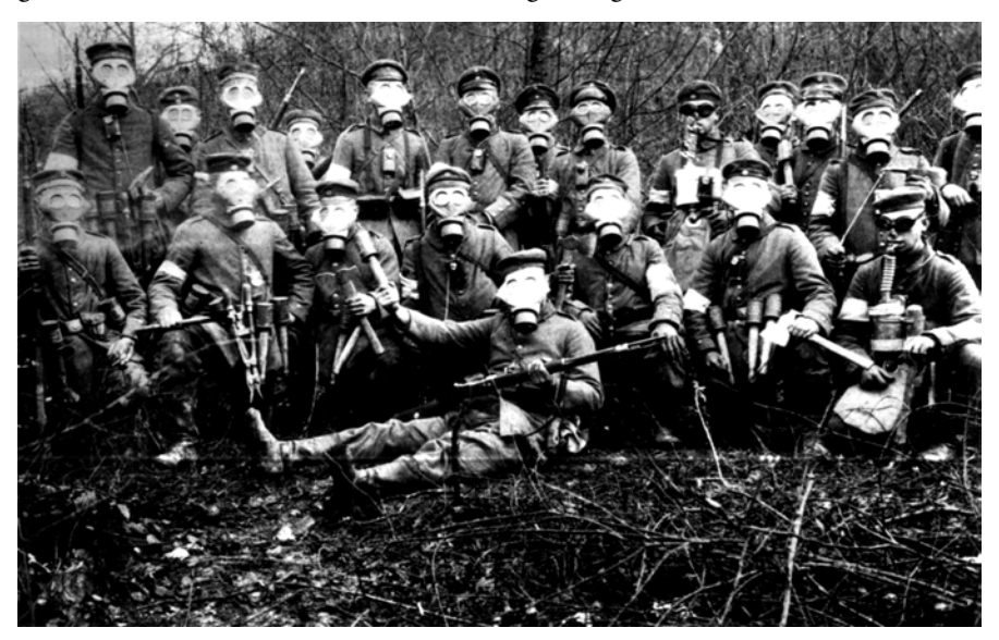
A group of German soldiers with gas masks and hand grenades. A peculiar tension is inherent in the picture. Group photos normally preserve individual and social memories, but in this case the masks depersonalize the individuals and would seem to prevent any memories.

tion of heroism and chivalry in battle which was still dominant in the culture of sounded power among many warring parties during the First World War. The idea of being chocked to death by gas without being able to breathe seemed a horrible and dreadful fate. As one British officer on the western front put it: 'A casualty from gunfire may be dying from his wounds, but they do not give him the sensation that his life is being strangled out of him.' <sup>17</sup>