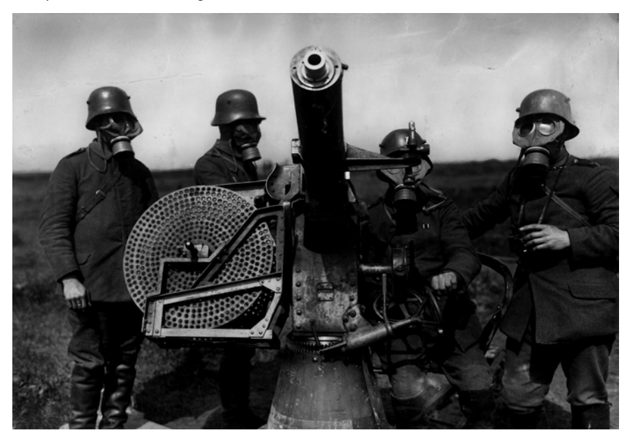
Sounded and silenced warfare. A German battery, March 1918

ous gas and a death caused by drowning on a sinking ship. Without delving more deeply into the morbid attempt to distinguish between different forms of dying on the battlefield, it is apparent that the hermeneutical question raised by different forms of soldiers' death not only perpetuated the age-old tradition of 'just war' theories that were rediscovered in Europe in the late nineteenth century, but was also deeply rooted in the new possibilities suggested by new war technologies.